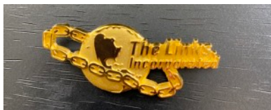
The Links, Incorporated Official Pin