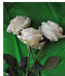
The Link's Flower The Rose