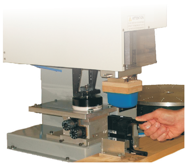
Our pad print machine has the capability of 1,200 cycles per hour. It can also print on a variety of materials such as glass, metal, plastic and rubber.

Our products consist of cables, adapters, transducers, harnesses, breakout boxes and diagnostic testers. These and similar products range from fast-turn prototypes to volumes in excess of 10,000 units.