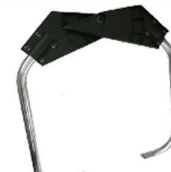
Rim Width Gauge 940051000