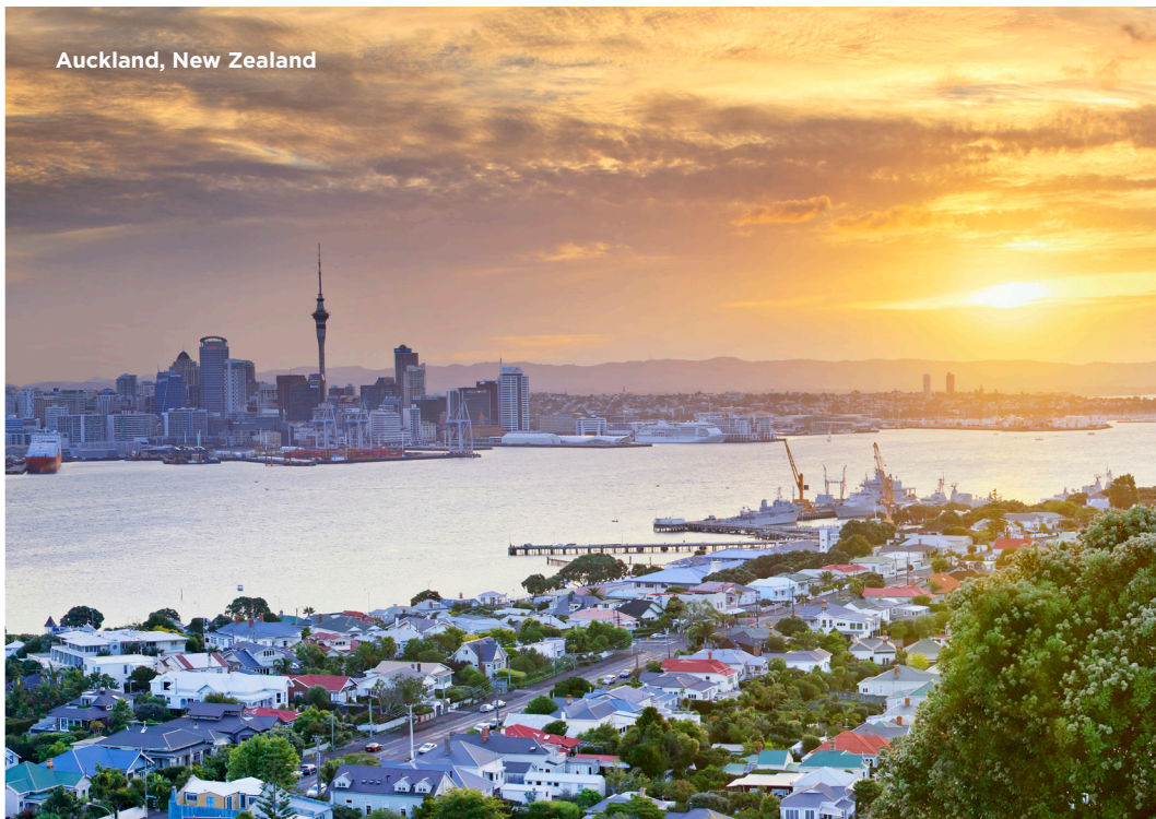
Auckland, New Zealand