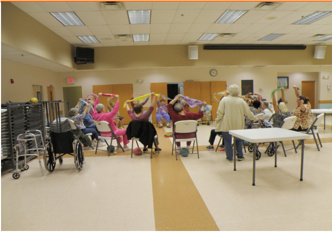
Monday morning sitting and strengthening exercise class. They like to use scarves for upper body exercises. One of our members donated a whole bunch of new scarves for us. Thank you!