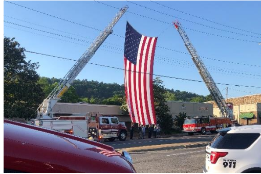
PICTURED ABOVE- 70 West Ladder 2 and crew assists with a flag raising ceremony at the Garland County Sheriffs Office Fallen Officer Memorial.