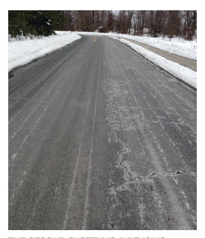
THE SECOND SYSTEM IS A DE-ICING ACCELERATOR WHICH SPEEDS THE MELTING OF THE ICE WHICH IT COMES INTO CONTACT WITH.

Triple Action can be pre-applied before ice or snowy weather to prevent ice or snow conditions form on the ground.