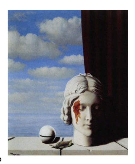
Rene Magritte, <u>La Memorie</u>, 1948

Bachelard felt that these images, which he called "poetic images", seem to appear out of nowhere - often strange and without language, "placing us at the origin of the speaking being."4 He states that this poetic image has no recent past "in which its preparation and appearance could be followed"<sup>5</sup> and exists without any specific reference to culture. He also surmises that this process necessarily occurs outside the normal intellect and emphasizes that while poetic image is the root of the creative process, the image is not in and of itself the poem. That process comes later and involves a much more intellectual process on the part of the artist. "The image has touched the depths before it stirs the surface". It is these images in the poem that are communicated to readers, becoming a catalyst for their own revelry, much in the vein of the symbolism within the collective consciousness of Jung, opening "hearts" to each other.