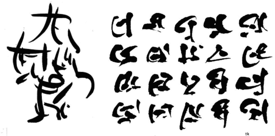
Cornelis Vleeskens, Cape Paterson, Australia, from Asemic Magazine, Vol. 2.

they're learning to write. Many of us made asemic writing before we were able to write words imitating our parents. Looking at asemic writing does something to us, it transforms us into a state of bewilderment; a state not unlike the Buddhist Big Sky Mind where clarity is a corollary of formlessness and each are mutually inclusive. Some examples have pictograms or ideograms, which suggest a meaning through their shape. Others take us meandering along their curves and sinuous slopes. Other forms are shapeless and exist as pure conception within the "garden of imagination and experience". We like some, we dislike others. They tend to have no fixed meaning outside our projected interpretation. Every viewer can arrive at a personal, absolutely correct interpretation.