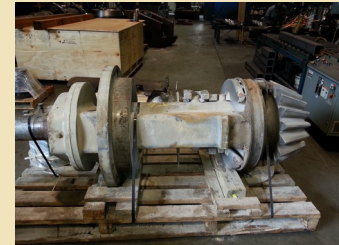
Before and After repair Countshaft