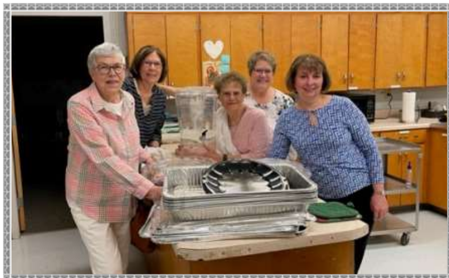
One of our fabulous serving teams!!

MEMORIAL SERVICE MONDAY, JUNE 12 AT 2:00PM