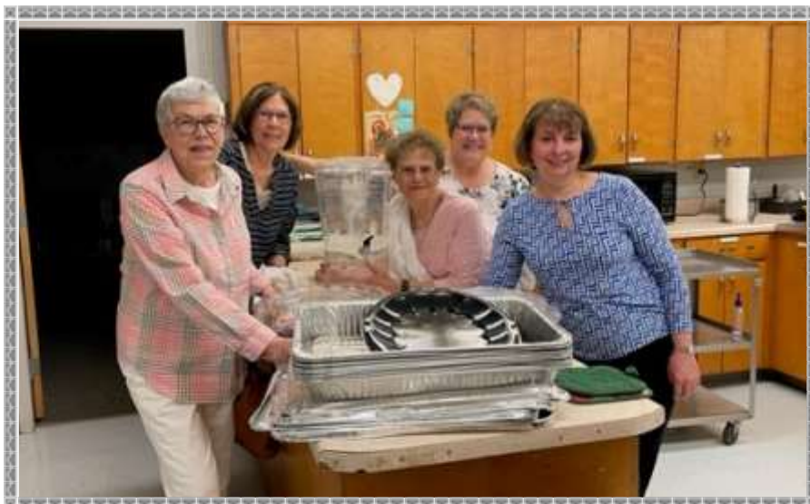
One of our fabulous serving teams!!

MEMORIAL SERVICE MONDAY, JUNE 12 AT 2:00PM