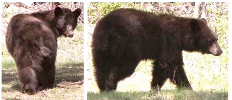
AMERICAN BLACK BEAR Ursus americanus (No distinct hump at shoulder, straight snout, large ears)