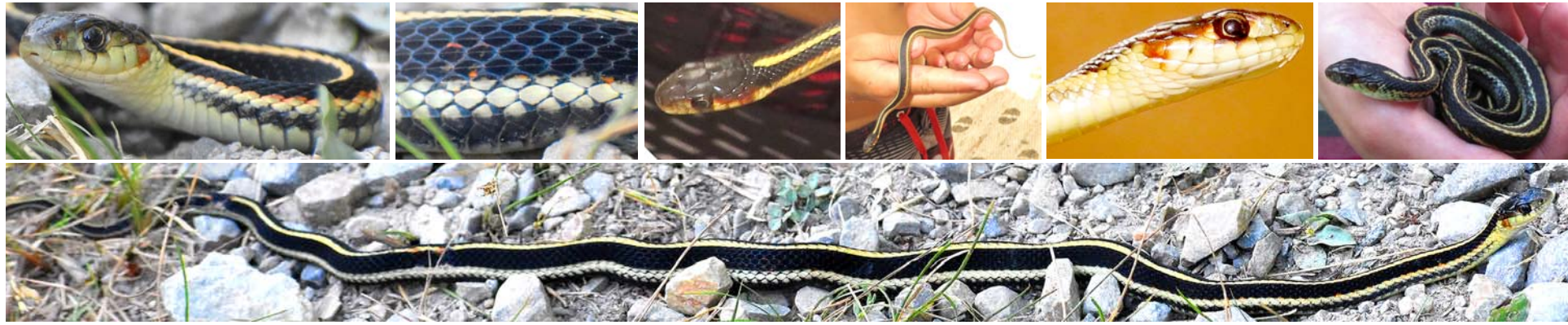
VALLEY GARTER SNAKE Thamnophis sirtalis ssp. fitchi (Dorsal and lateral stripes and red blotches on sides) (A subspecies of the Common Garter Snake T. sirtalis)

WESTERN PAINTED TURTLE Chrysemys picta ssp. bellii (Orange-red underside, aquatic, often seen "sunning" on logs and rocks, treks up from lake to lay eggs)