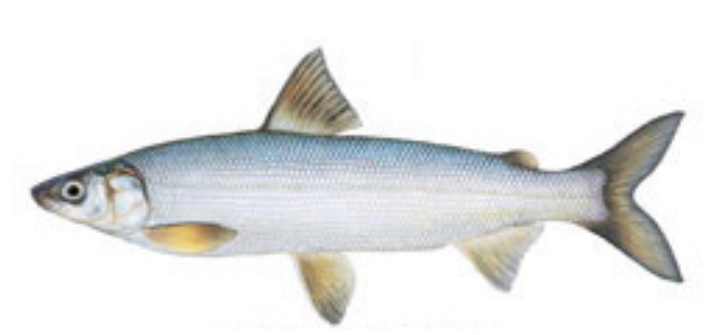
LAKE WHITEFISH Coregonus clupeaformis (Large scales, no spots, small mouth, no teeth, body olive green to light brown. INTRODUCED)