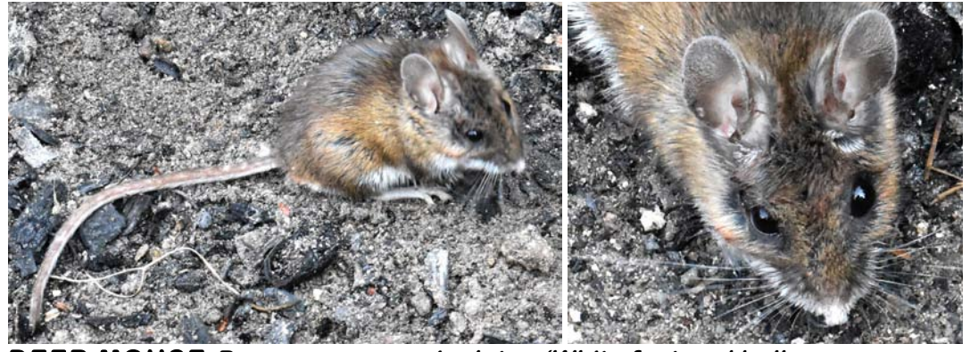
DEER MOUSE Peromyscus maniculatus (White feet and belly, tail dark above and white below and as long as rest of body)

SNOWSHOE HARE Lepus americanus (Brown-gray in summer, turns all white in winter except black ear tips, very large hind feet)