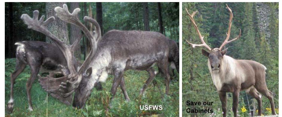
WOODLAND CARIBOU Rangifer tarandus caribou (Severely endangered, Selkirk Mountains herd may be extinct)