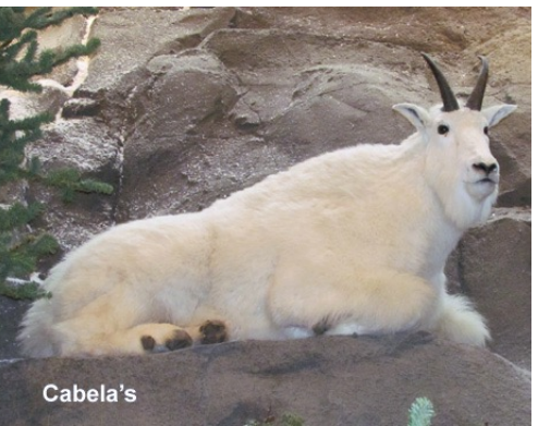
MOUNTAIN GOAT Oreamnos americanus (White, beard, short tail, on cliffs)

AMERICAN BISON Bison bison ( Not wild, only occurs in Bison farm )