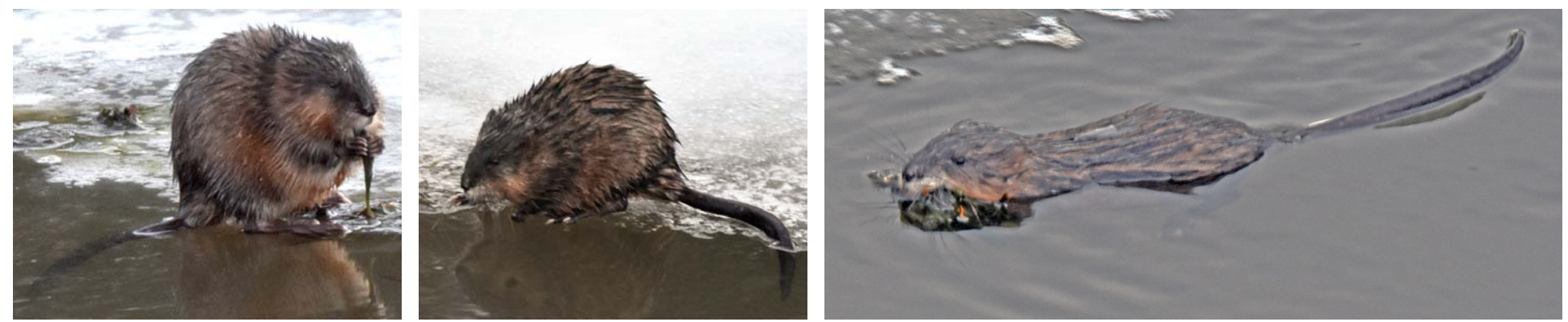
MUSKRAT Ondatra zibethicus (Tail naked, scaly, black, flattened from side to side, fur brown, belly silvery)