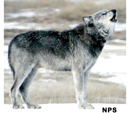
GRAY WOLF Canis lupus (gray to black)

COYOTE Canis latrans (Legs & ears rusty, pointy nose) RED FOX Vulpes vulpes (Bushy tail with white tip, legs and feet black)