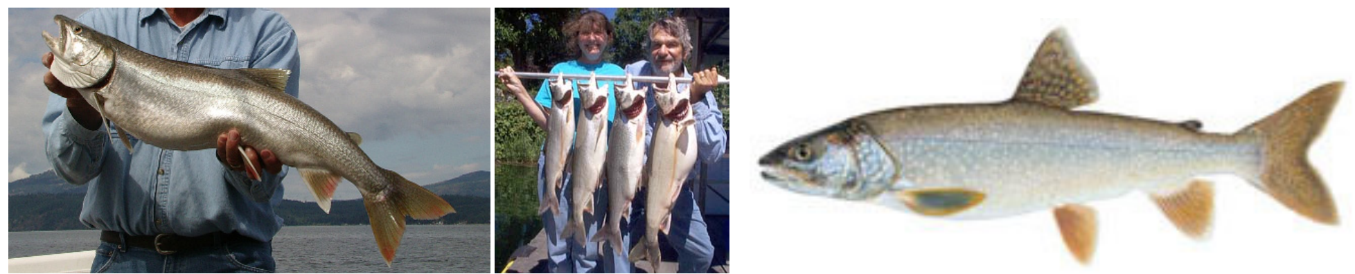
LAKE TROUT (Mackinaw) Salvelinus namaycush (Body dark gray to gray-green, belly light gray to white, irregular shaped light gray spots on back, sides, dorsal fin and tail, deeply forked tail. INTRODUCED)