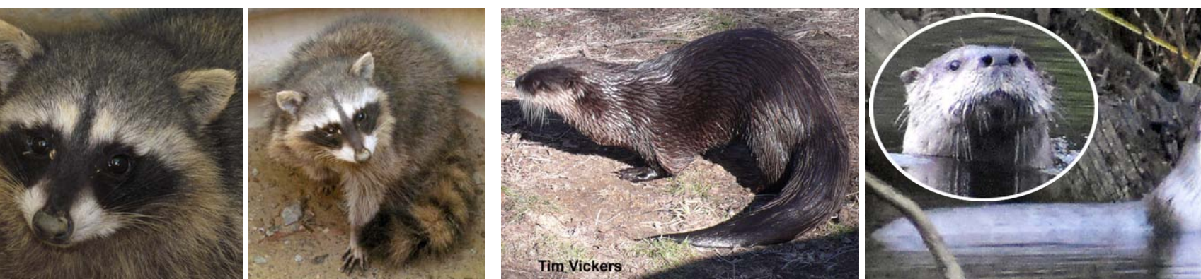
COMMON RACCOON Procyon lotor (Black face mask, rings on tail)