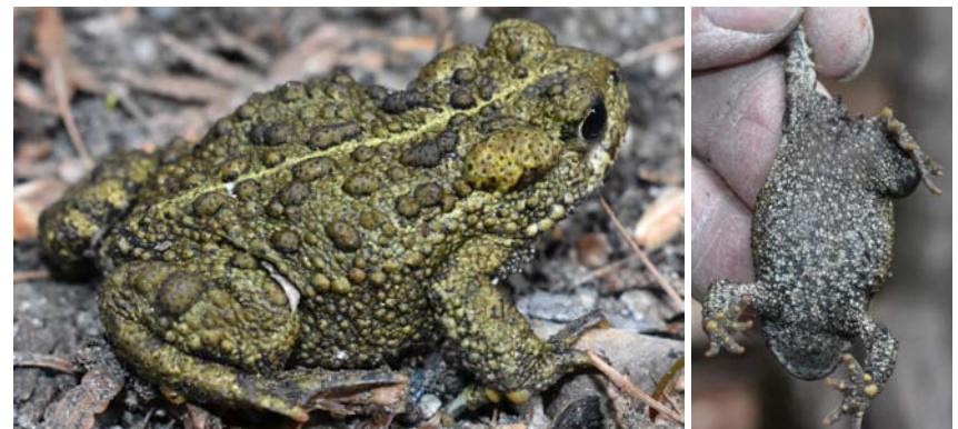
WESTERN TOAD Anaxyrus boreas (White back stripe, spotted belly)

COEUR D'ALENE SALAMANDER Plethodon idahoensis