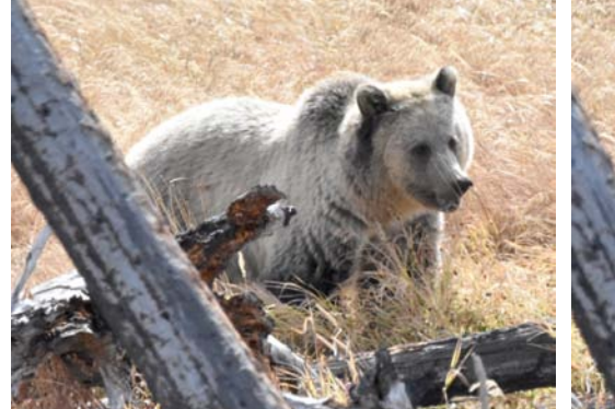
GRIZZLY BEAR Ursus arctos ssp. horribilis (Hump at shoulder, dished snout, small ears, keeps to back country)