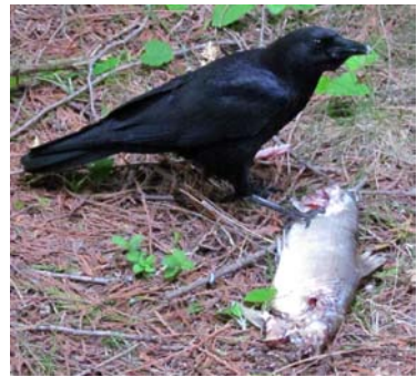
Crow with Whitefish stolen from Osprey