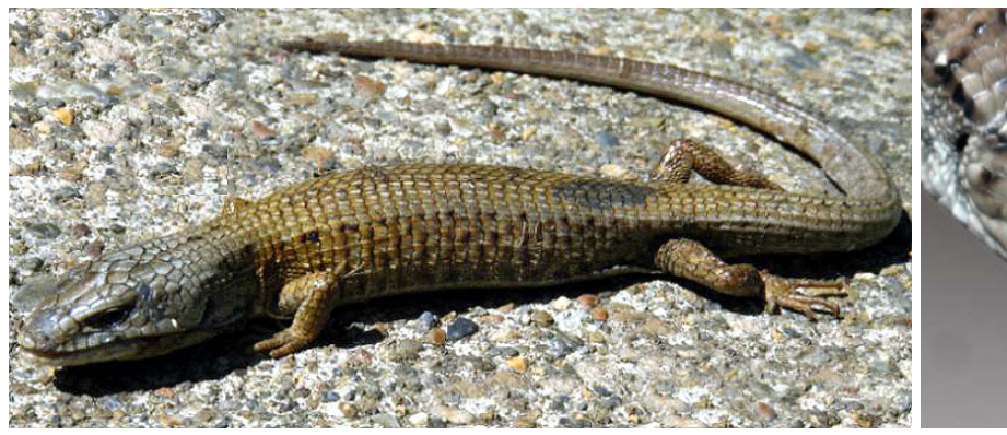
NORTHERN ALLIGATOR LIZARD Elgaria coerulea