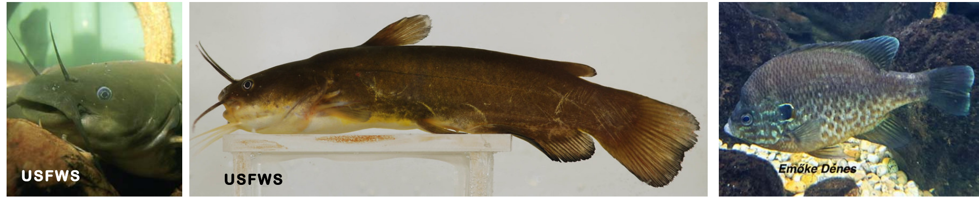
YELLOW BULLHEAD Ameiurus natalis