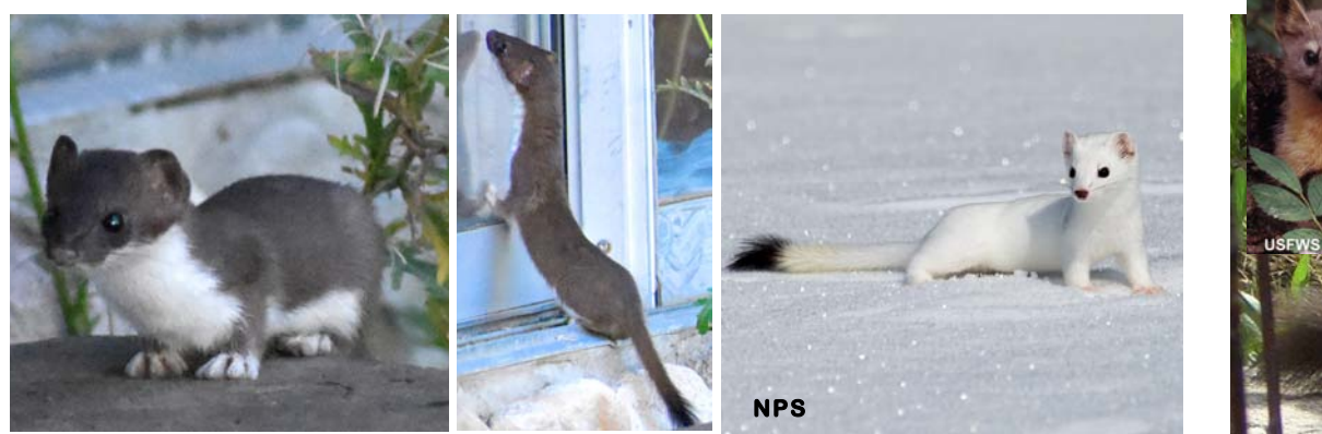
SHORT-TAILED WEASEL Mustela ermine (Also known as "ERMINE", turns all white in winter except black tail tip)