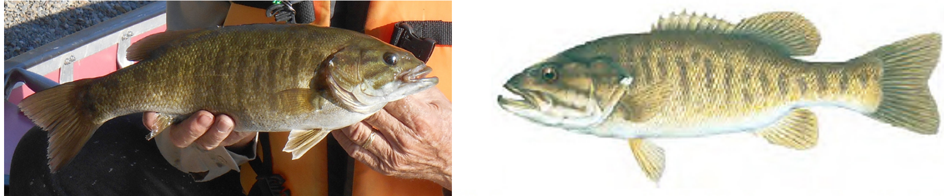
SMALLMOUTH BASS Micropterus dolomieui (Back olive to brown, sides bronze, belly white, vertical bands on sides, eyes reddish, upper jaw when closed does not extend behind eye, scaly. (INTRODUCED)