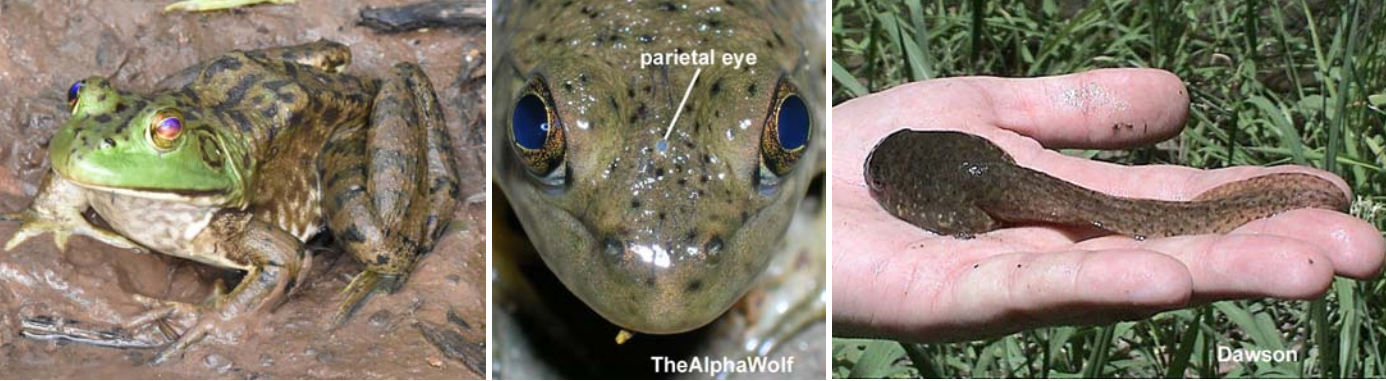
AMERICAN BULLFROG Lithobates catesbeianus (Largest frog around 3-6", large eardrum, sound a loud bass "garump", large tadpole, juvenile has "parietal eye" atop head, INTRODUCED)