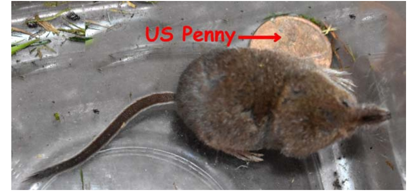
SHREW Sorex sp. (Tiny, mouse-like, very small ears, forages frantically in lawns for insects)