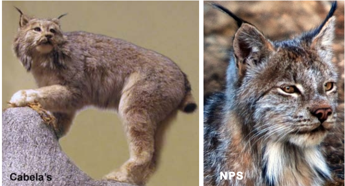
LYNX Lynx lynx (Long ear tufts, tip of short tail black all around)