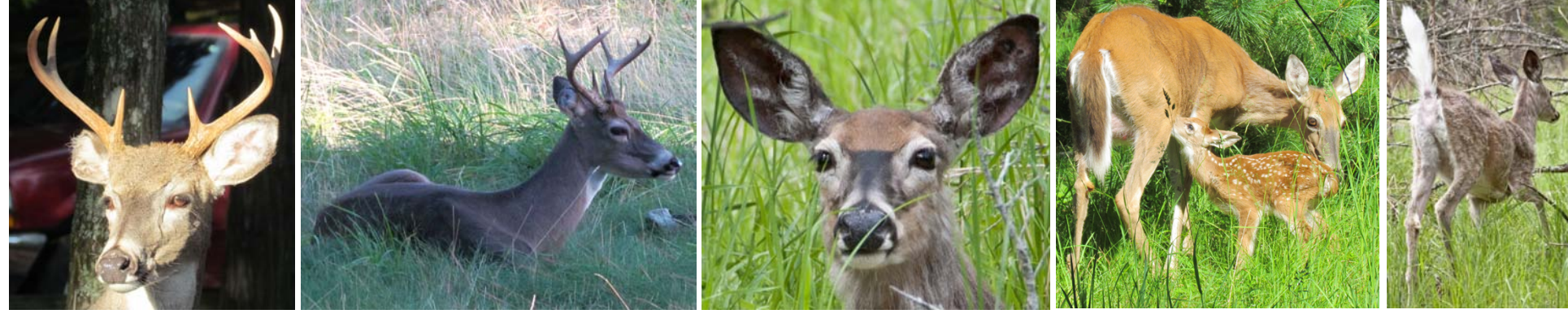
WHITE-TAILED DEER Odocoileus virginianus (Large tail white underneath, no black tip, erect when startled, antlers branch up from main beam, numerous in populated areas near lake)

BONNER COUNTY, IDAHO AND THE IDAHO PANHANDLE NATIONAL FOREST