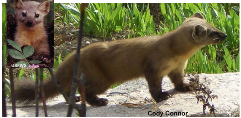
AMERICAN PINE MARTEN Martes americana (Yellowish fur shading to brown on legs & bushy tail, pale buff throat and breast)