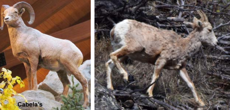
BIGHORN SHEEP Ovis Canadensis (Ram, ewe, sometimes seen on HW 200 southeast of lake)