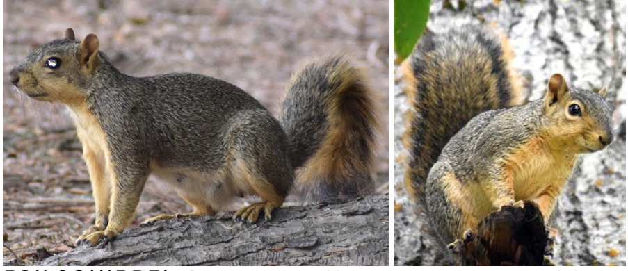
FOX SQUIRREL Sciurus niger (Common in towns, yards)