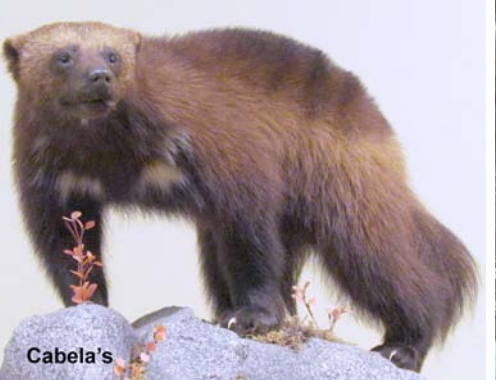
WOLVERINE Gulo gulo (Rare and threatened)