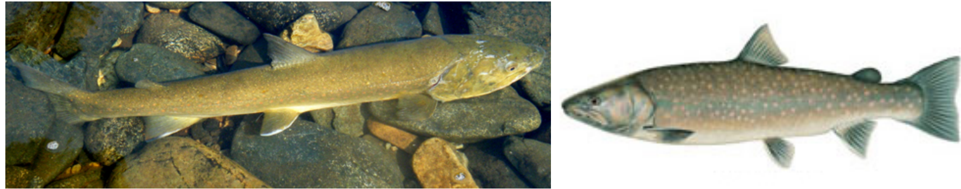
BULL TROUT Salvelinus confluentus (Body olive-green, belly white, upper body with yellow spots, sides with red or orange spots, no halos around spots, no spots or black marks on dorsal fin, tail slightly forked. NATIVE, NO HARVEST ALLOWED)