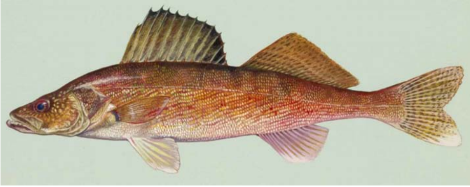
WALLEYE Sander vitreus (INTRODUCED)