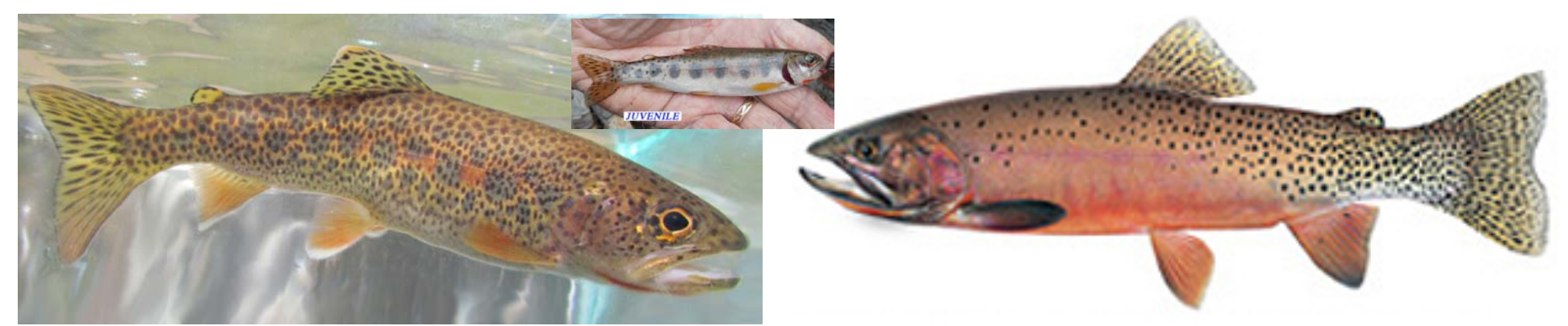
CUTTHROAT TROUT Onchorhynchus clarkii (Distinctive red-orange slashes on underside of lower jaw, body color variable, back gray to olive green, sides may be yellow-brown with red or pink belly, spots on dorsal fins and tail. NATIVE)