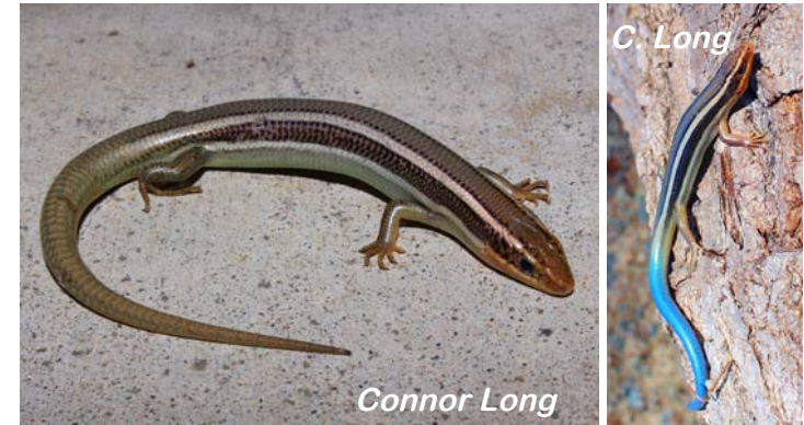
WESTERN SKINK Plestiodon skiltonianus (Dark side body stripe, juveniles have blue tail)