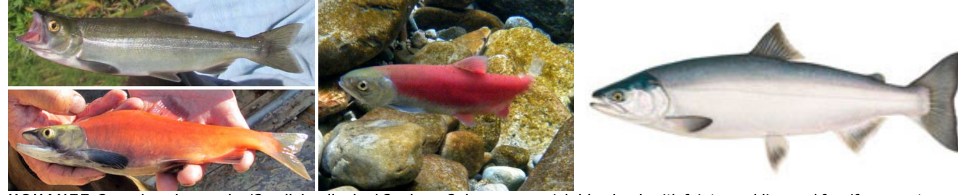
KOKANEE Oncorhynchus nerka (Small, landlocked Sockeye Salmon , greenish-blue back with faint speckling and few if any spots, sides & belly silvery, no spots on dorsal fin or tail. Spawning color red, with greenish head in Sept.-Dec.)

COMMON GAME FISH Drawings from Idaho Fish & Game Fish Identification site (https://idfg.idaho.gov/rules/fish)