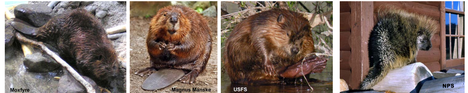
NORTH AMERICAN BEAVER Castor canadensis (Tail naked, scaly and paddle-shaped, large front teeth, hind feet webbed)