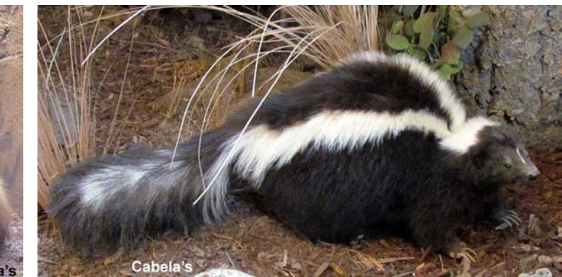
STRIPED SKUNK Mephitis mephitis (White "V" on back)