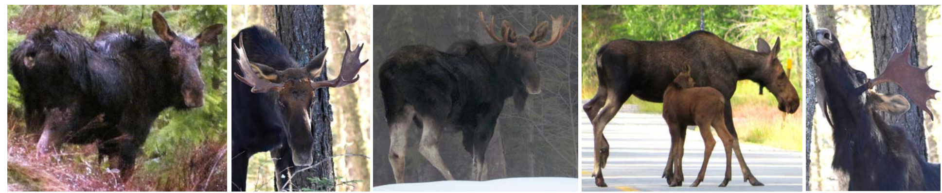
MOOSE Alces alces (Large, ungainly, dark brown body, gray legs, big overhanging snout, throat pendant, distinctive "palmate" antler)