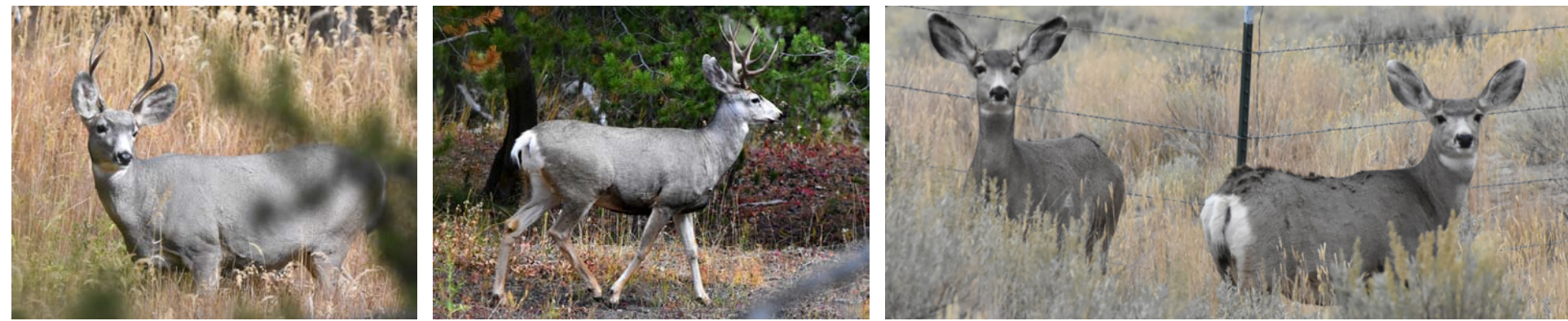
MULE DEER Odocoileus hemionus (Whitish rump, tail with black tip, large ears, antlers bifurcated, generally stays in high mountains)