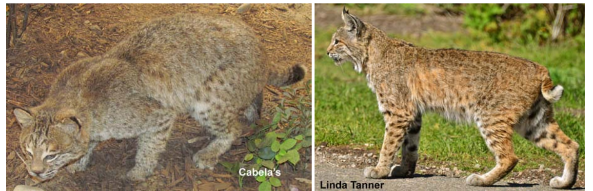
BOBCAT Lynx rufus (Short tail with tip black on top only)