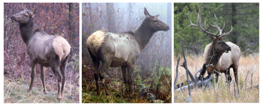
ELK Cervus canadensis (Pale yellow rump patch, small white tail)