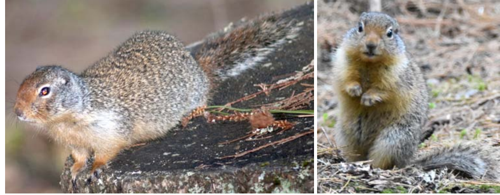
COLUMBIAN GROUND SQUIRREL Urocitellus columbianus (Burrowing, small ears, reddish feet and legs, short bushy tail)