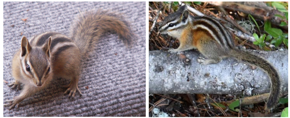
WESTERN CHIPMUNK Neotamias sp. (possibly the "LEAST CHIPMUNK" Neotamias minimus)

AMERICAN RED SQUIRREL Tamiasciurus hudsonicus (Ear tufts, black side stripe between the white belly and gray back)