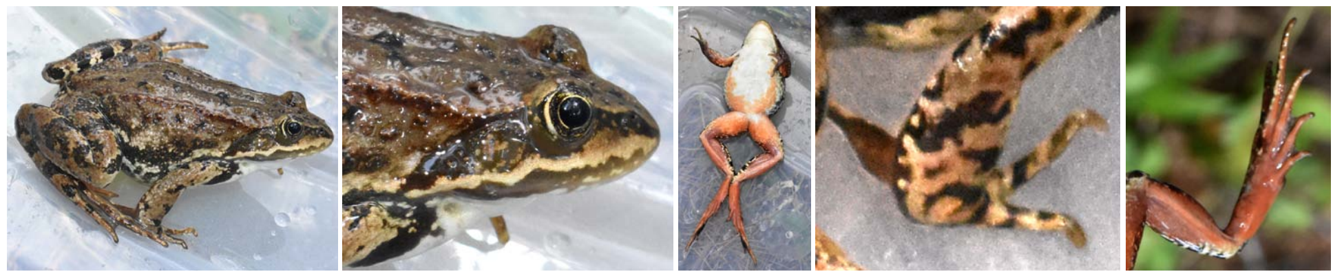
COLUMBIA SPOTTED FROG Rana luteiventris