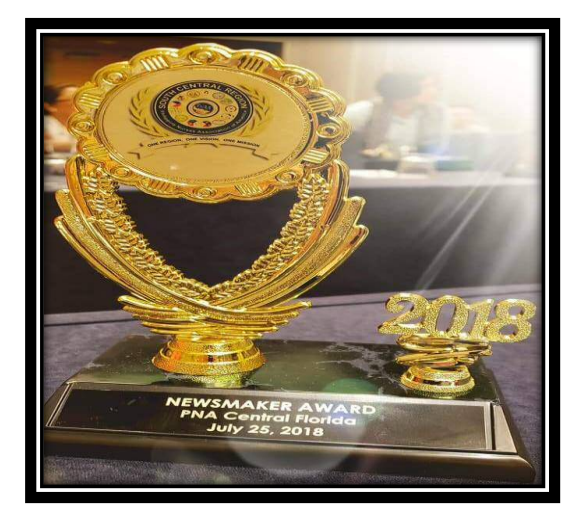
PNACF Newsmaker Award 2018