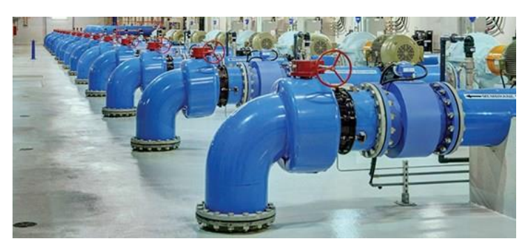
GWD Distribution System Testing