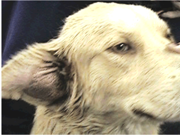
Aural hematoma in a dog's earflap.

impossible) to clear up. The ear canal may mineralize and the middle ear may come to be involved, leading to nerve damage. Affected animals may have a head tilt, a lack of balance, and unusual back-and-forth eye movements (called nystagmus.) These symptoms are called vestibular signs and represent a complication of middle ear infection. Middle ear infections can also cause paralysis of the facial nerve, leading to a slack-jawed appearance on that side of the face.