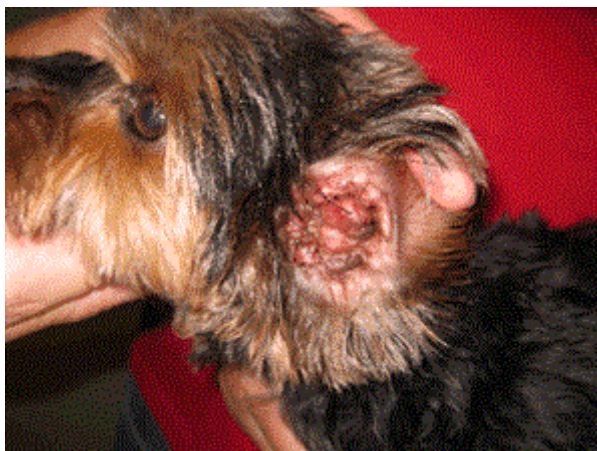
Chronic inflammation has led to proliferation of ear tissue. Bacteria and discharge can hide in all the nooks and crannies. The vertical canal has been surgically opened so as to facilitate cleaning.

A routine ear infection is uncomfortable enough but if the infection persists, it can