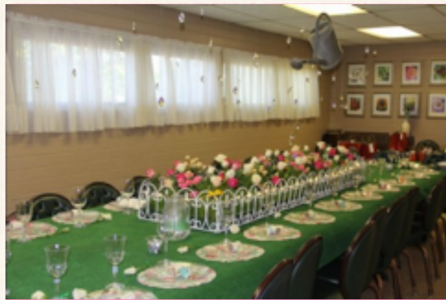
Rose Circle Table from May Spring Luncheon Clever display for “April Showers bring May Flowers”

The Rose Circle was organized in 1927. At this time we have 31 members. We support SEEK, Wekiva and other FFGC programs and participate in all the Garden Club projects. We have horticulture reports at every meeting. Field trips are planned, work projects, fun crafts, and community service are some of our other projects we enjoy doing.