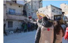
Left: The destroyed Cathedral of Iskenderun. Right: Earthquake response by Caritas network.