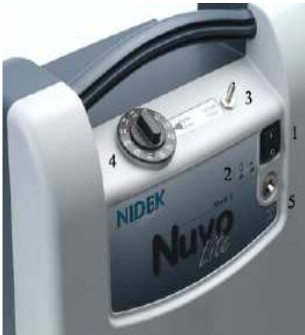
2.1. Front panel (Fig. 2.1)