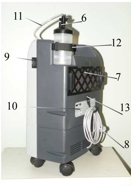
2.2. Rear panel (Fig. 2.2)