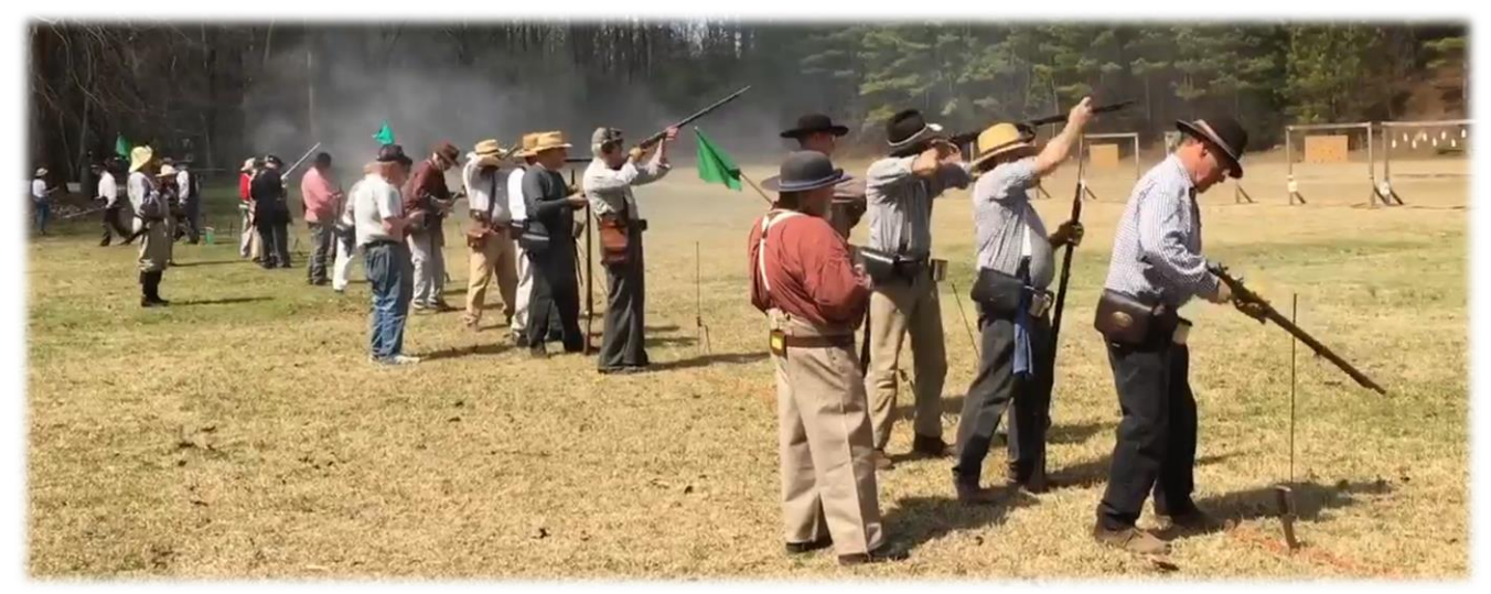
More smoothbore action!

After the smoothbore match came the carbine match. Seven teams took to the field, including two B teams. Forrest's Escort A team took first place, with the 3<sup>rd</sup> Georgia taking second, followed by the 14<sup>th</sup> Mississippi taking third.