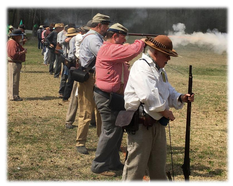
Smoothbore shooters sending smoke and flame down range!

After the revolver match the field was quickly reconfigured for individual shooting once again. Shooters rushed to finish all their guns before the lunch break. Then they rushed the snack shack! After lunch, team competitions began with smoothbore shooting. Seven smoothbore teams took to the field. When all was said and done Forrest's Escort A team took first, the 4<sup>th</sup> Louisiana Delta Rifles took second, and the 14<sup>th</sup> Mississippi taking third.