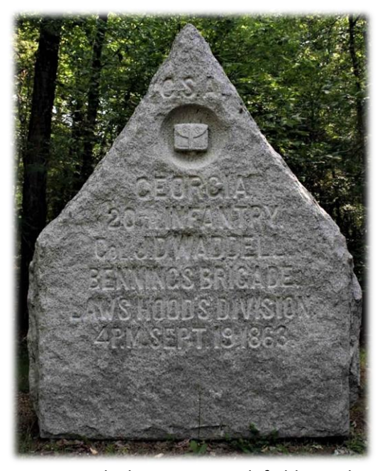
20th Georgia monument at Chickamauga Battlefield.

The 20<sup>th</sup> Georgia hosted the second skirmish of the 2021 Deep South season at our traditional haunt, Brierfield Ironworks State Park. The weather was picture-perfect this year, with the beginnings of spring in Dixie bringing us partly sunny skies, brisk mornings, and shirtsleeve days all weekend long.