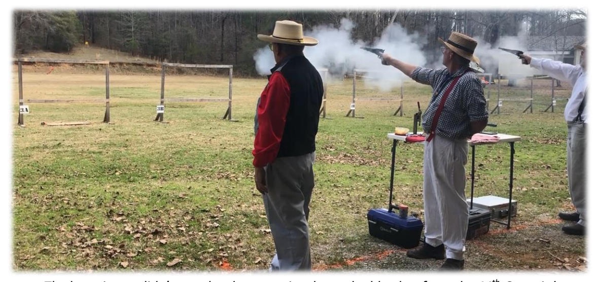
The last pigeon didn't stand a chance as it takes a double-shot from the 44<sup>th</sup> Georgia!