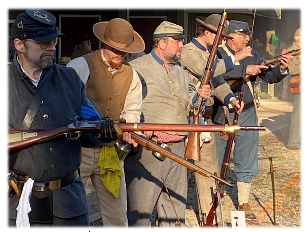
The 4<sup>th</sup> Louisiana getting it done in the Musket Match!

Shooters picked up their muskets, and 8 teams found their places on the firing line before the sun had even broken over the tree tops. When the last of the tiles broke on the 100 yard line, the results found Forrest's Escort A team in first place, followed by the 3<sup>rd</sup> Georgia in second, followed by the 4<sup>th</sup> Louisiana Delta Rifles in 3<sup>rd</sup>. The Forrest's Escort B team took first place in the B team competition.