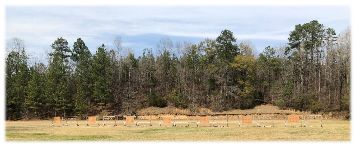
A picture-perfect field set up for Carbine.