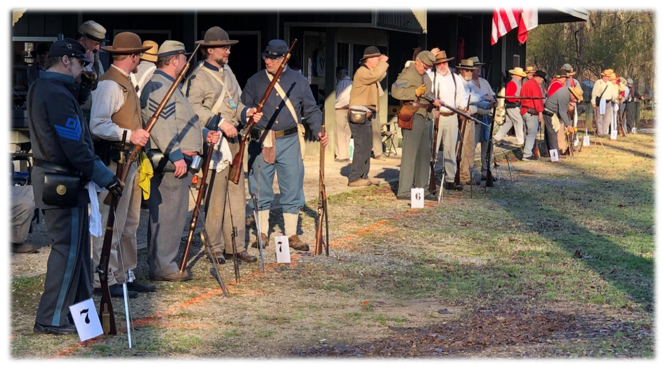
Getting ready for Musket action!

With the Musket Match concluded, teams pitched in with cleaning up the debris, and then packed their gear, said their goodbyes, and headed home, putting another Deep South skirmish into the history books.