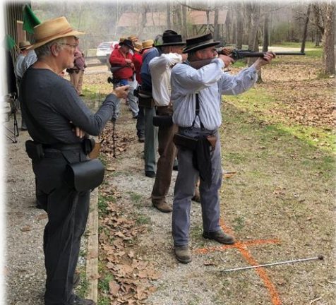
More teams vying for top billing in Carbine!

Teams broke for the evening to find grub where they might, with an admonishment to remember to set their clocks forward an hour that evening due to the time change. No one wanted to be an hour late for the Musket Match!