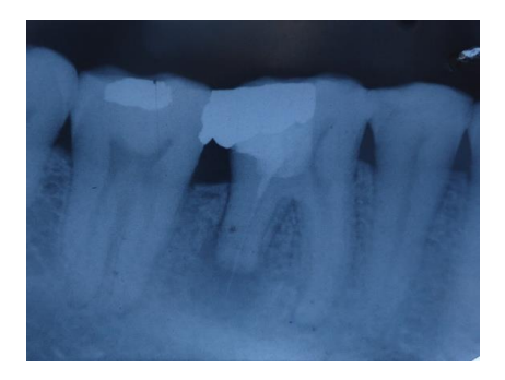
Figure 13: Preoperative radiograph