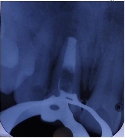
Figure 5: MTA apical plug created