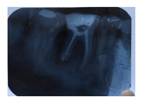
Figure 16: Post operative radiograph showing obturation of distal canal

Figure 15: placement of apical plug at distal root of the molar and obturation of the mesial roots