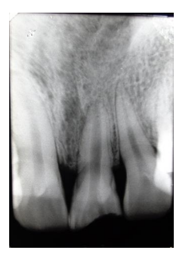
Figure 10: Preoperative radiograph