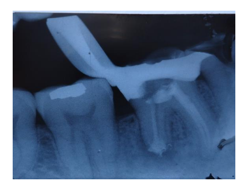
Figure 15: placement of apical plug at distal root of the molar and obturation of the mesial roots