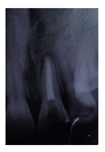
Figure 12: Post operative radiograph