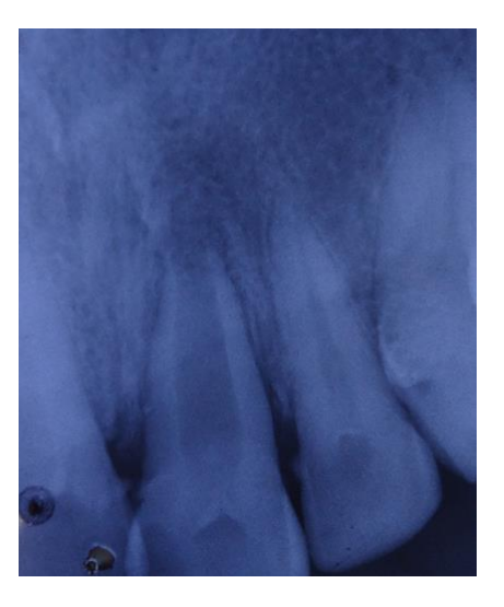
Figure 4: Preoperative radiograph showing incompletely formed apex of maxillary central incisor