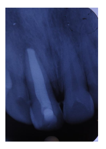
Figure 6: Post operative radiograph