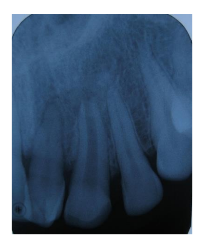
Figure 7: Preoperative radiograph