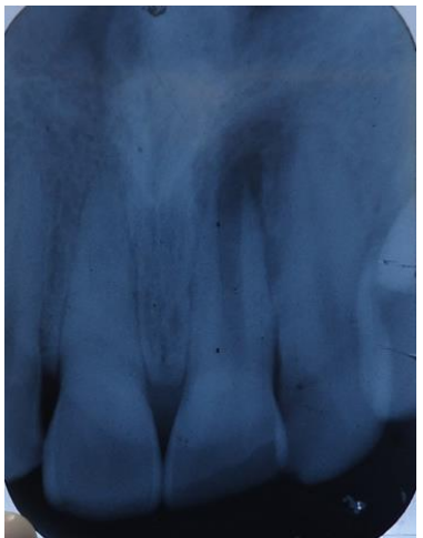
Figure 1: Preoperative radiograph showing blunderbuss apex and perapical radiolucency