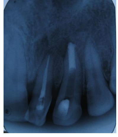
Figure 8: MTA Apical plug formed