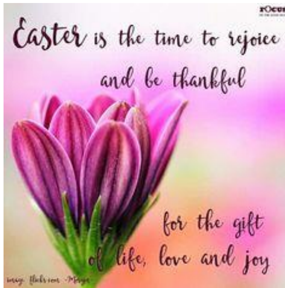
April's Gratitude Image from Maureen Hughes