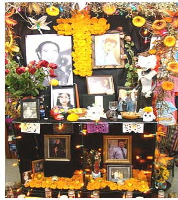
Tableau Of Deceased in November

During the month of November, "All Souls Month", the Church commemorates her faithful departed. As we did in previous years, St. Mary's will ritualize this with a Tableau to the Deceased