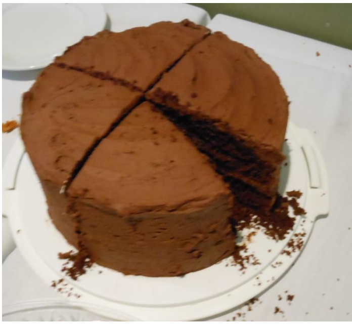
Just remember, once over the hill you pick up speed