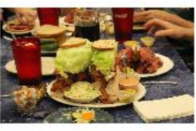
Don I wouldn't even think about it if I were you....