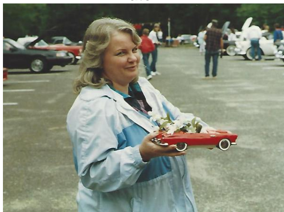
A picture from yesteryear

This event is May 5th at the Martin's Additional information will be announced later.