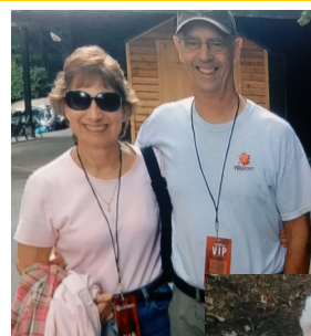
A few of the couples that made Tecumseh a Date Night!