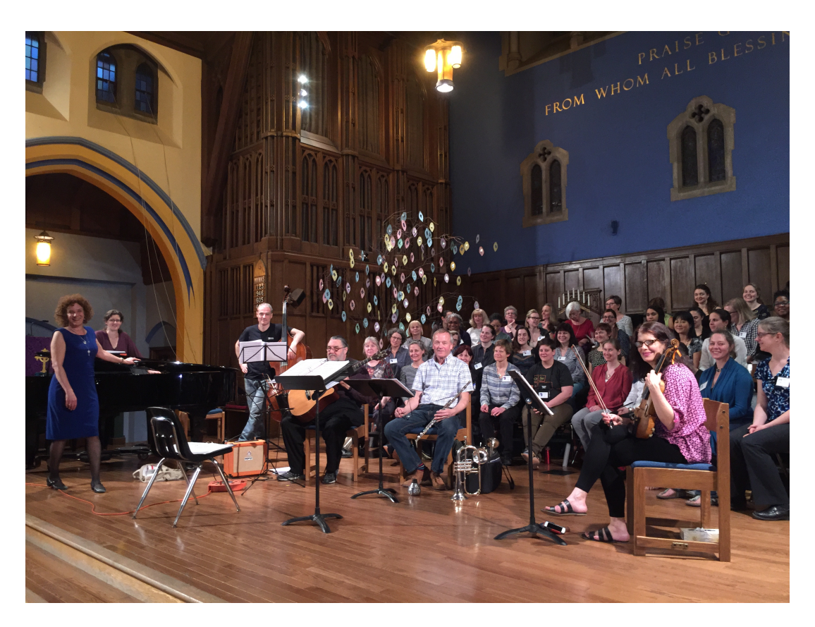
Cantores Celestes Musician