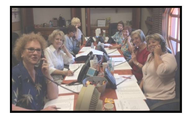
Navajo Canyon ladies working at GOP Headquarters Friday, October 21. We had a great job this time! Calling Republicans that had previously signed up to volunteer.

Almost every person we spoke with signed up to be a precinct captain! We left lots of messages and hopefully they called back and signed up too!!