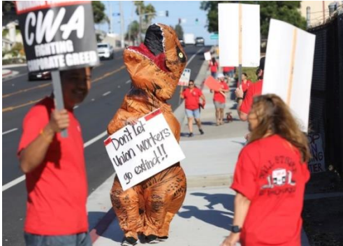
Local 9510 Rally

Please continue your mobilization efforts. This is a fight for a fair contract. We are in this together fighting for our future.