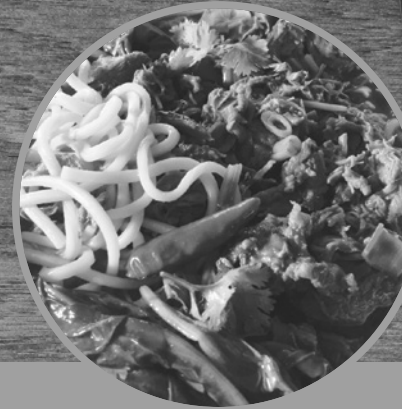
Beef Stew Noodle Soup