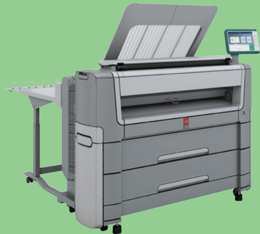
MULTIFUNCTION SYSTEM WITH OPTIONAL OCÉ DELIVERY TRAY AND OPTIONAL MEDIA DRAWER