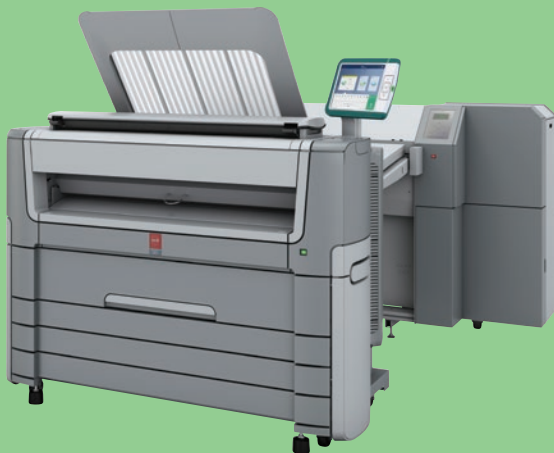
MULTIFUNCTION SYSTEM WITH OPTIONAL OCÉ 4312 FULLFOLD