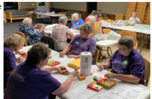
2023 LWML Retreat coloring cards for Phil's Friends, a non-profit that provides care for cancer patients

Another specific day to look forward to this “off-season” is our Fall Workday. Our Fall Workday is scheduled for Saturday, November 2nd. We are planning on doing some maintenance to fix things up around the horse activity areas. Additional information will be provided as that day gets closer. Any help with this will be greatly appreciated and will be of great assistance primarily to our summer program as the horses are a big attraction and Horse Camp is our most popular camp!