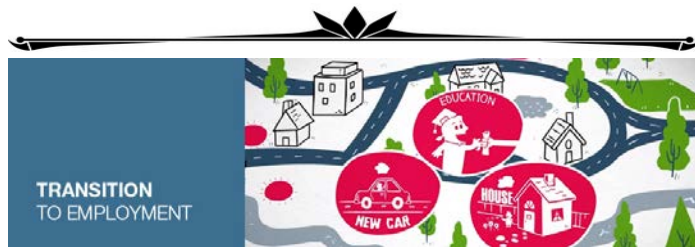
Map Your Own Way - Transition to Employment