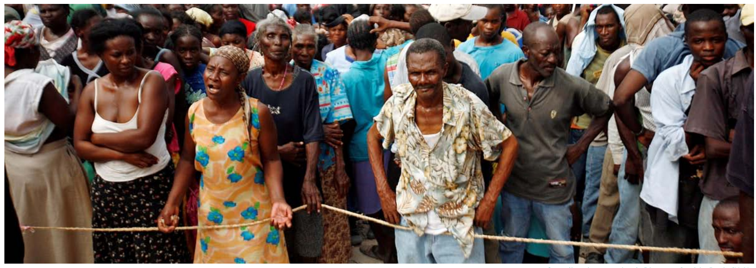
Coordination required.

N January 12, 2010, Haitians experienced one of the worst natural disasters of the century. An initial earthquake of 7.0 and 52 subsequent aftershocks ravaged the city of Port-au-Prince, leaving rubble and debris in its wake. The U.S. Geological Survey estimates that 222,570 people lost their lives and more than 300,000 were injured. The magnitude of devastation was immense, with 97,294 houses destroyed, another 188,383 damaged and approximately 1.3 million people displaced from their residence.