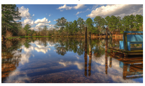
Lake Siesta, La Grange, Texas Bruce Lande