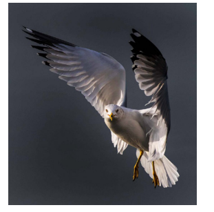
Are You Looking at Me? Stennis Shotts