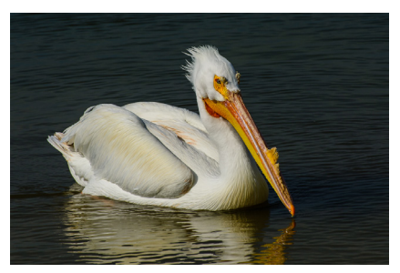
White Pelican Beverly McCranie