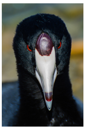
Red Eyed Coot Beverly McCranie