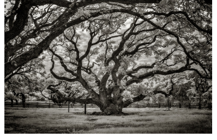
Thousand Year Old Tree at Goose Island Pete Holland