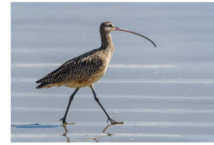
Long Billed Curlew Dolph McCranie