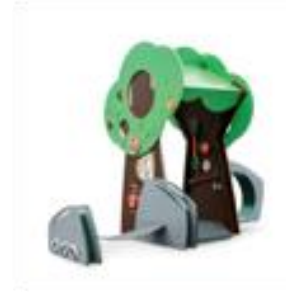
Mini City Silly Tree $15,000