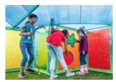
Sensory Panels $3,000 each