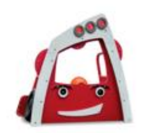
Mini City Truck $10,000