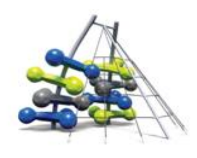
JAX Web Climber $17,000