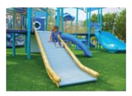
Accessible Roller Slide $15.000