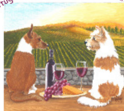
National Specialty 2016 Santa Rosa, CA