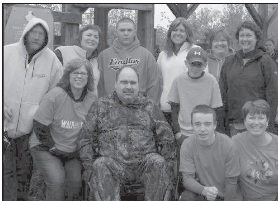
Pictured is team "Just Koz" during the National Multiple Sclerosis Society's fundraising walk held at the Columbus Zoo.