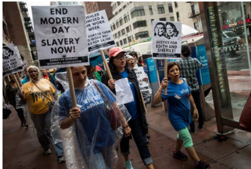
Activists rally to support two Filipina domestic workers who had shifts of more than 90 hours per week and earned as little as four dollars per hour.