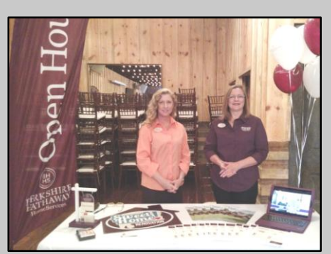
Berkshire Hathaway Home Services