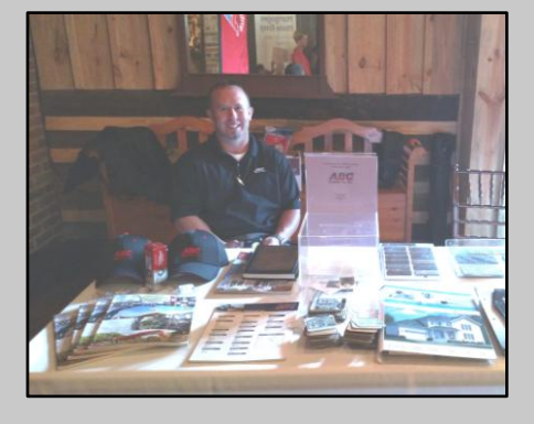
ABC Supply Co.