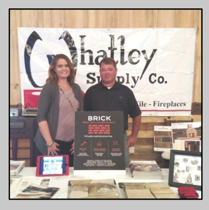
Whatley Supply Co.