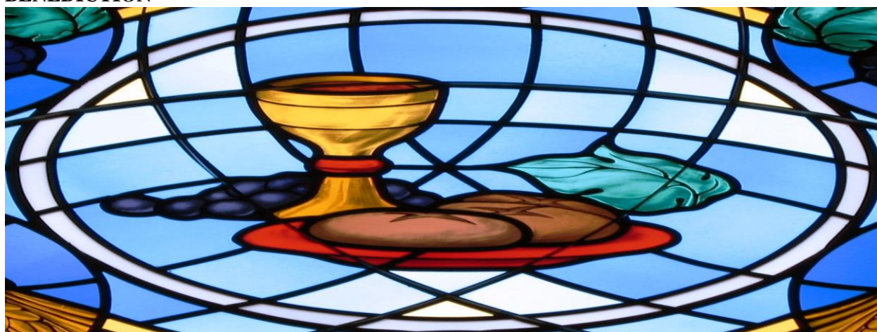
The Presbyterian Church, Plainfield, New Jersey UNISON CALL TO WORSHIP (Psalm 23)

PRELUDE WELCOME UNISON CALL TO WORSHIP OPENING HYMN CALL TO CONFESSION UNISON PRAYER OF CONFESSION ASSURANCE OF PARDON ANNOUNCEMENTS PASSING THE PEACE THE WORD FIRST READING SECOND READING SERMON PRAYERS OF THE PEOPLE INVITATION TO DISCIPLESHIP COMMUNION HYMN INVITATION TO THE LORD'S SUPPER THE LORD'S PRAYER CLOSING HYMN BENEDICTION