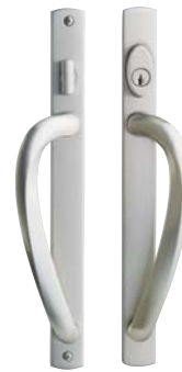
SLIDING PATIO DOOR HANDLE SETS (STANDARD)

Weather Shield's all-metal patio door hardware features two- and three-point locking systems, plus matching adjustable hinges, in a Brushed Nickel finish. An optional key lock is also available.