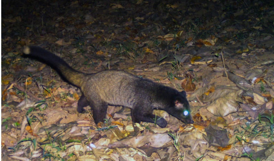
Fig. 2. Brown Palm Civet Paradoxurus jerdoni in the wet evergreen forest of the southern Western Ghats, Southern India.

lacks pungent odour (Mudappa et al. 2010). No DNA analysis of the collected faeces was done; it is, therefore, unknown if there were any species misidentification errors.