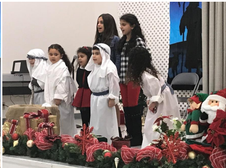
St. Mary Armenian Church, Yettam Armenian Christmas Sunday School Program January 7, 2018