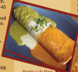
Burrito 5 de Mayo