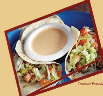
Tacos de Pescado