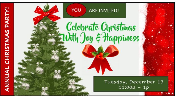
WE ENCOURAGE YOU TO COME TO OUR PARTY!