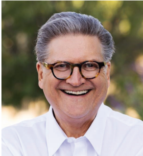
Senator BOB HERTZBERG