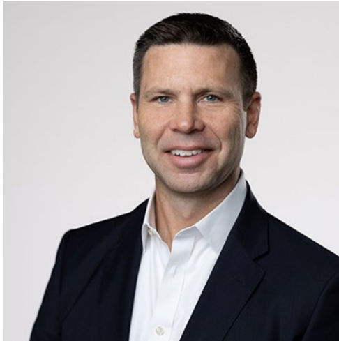
Kevin McAleenan Chief Executive Officer

Kevin K. McAleenan Former Secretary of Homeland Security