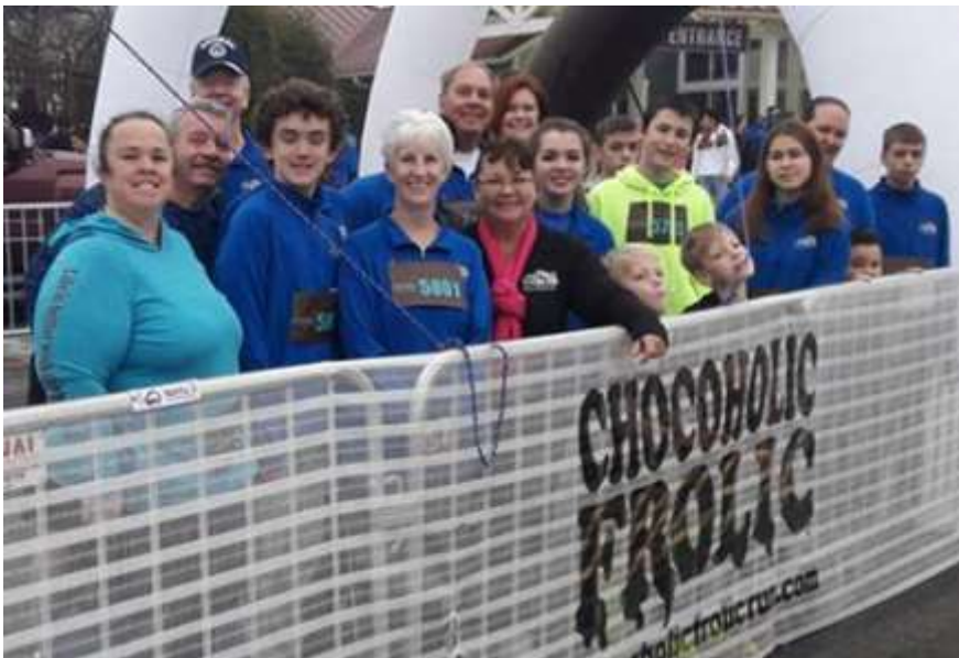
21 Runners from CTK participated in our 2nd Annual Chocoholic Frolic at Morgan’s Wonderland.