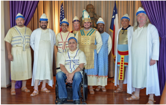
El Paso 24th Degree team