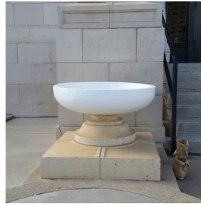
After many, many years we have finally replaced the broken and missing bowl in front of the building. This is an exact copy of the original. To top it off we now own the mold and can make replacements if ever needed. Next on the list is to paint it to match the other three existing bowls.