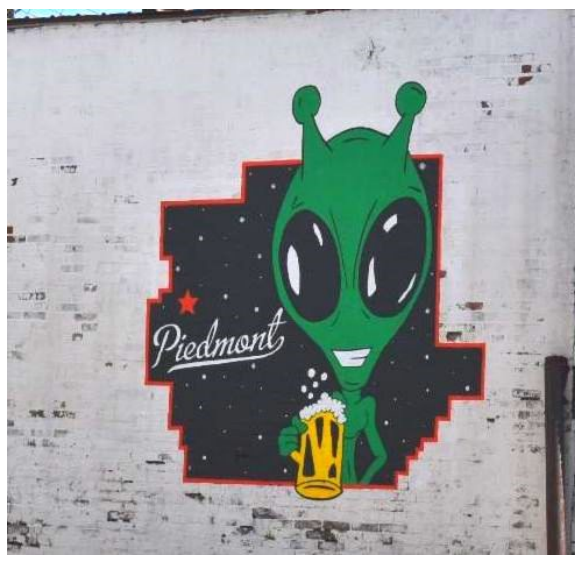
A local pub put up a permanent mural