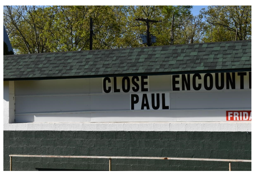
The local drive-in theater got involved too!