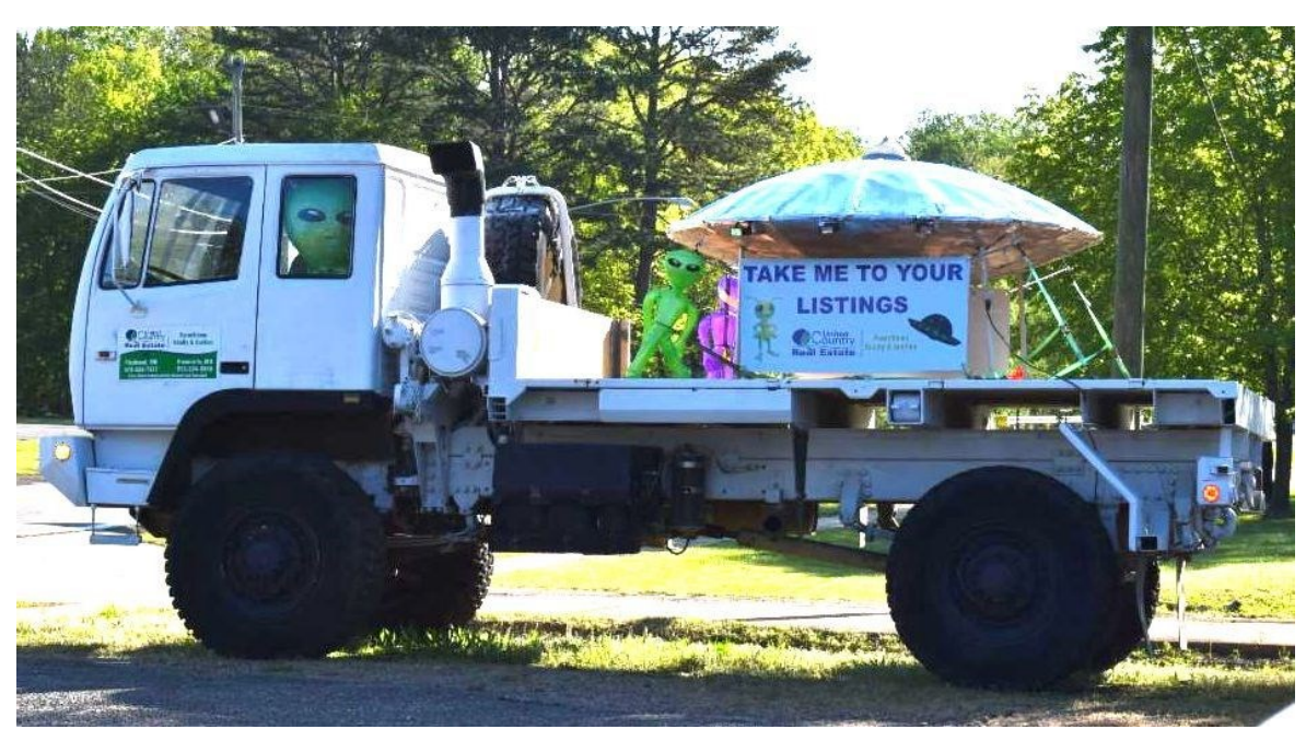
A local realtor really got into the spirit and took first place in the contest!