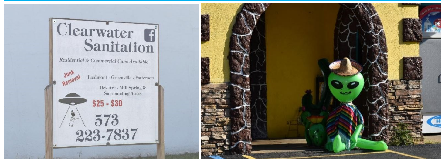
Even a sanitation company is involved in UFOs!