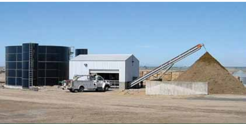
Right: Feeding a digester with thickened flush manure on a 900 cow sand bedded dairy in Western Washington.